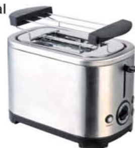
● TXT-829J Removable bun warmer