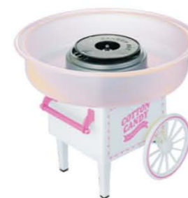
Cotton Candy Machine