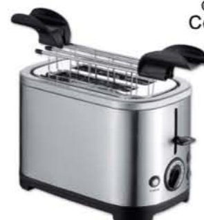
● TXT-829A Bread pliers optional