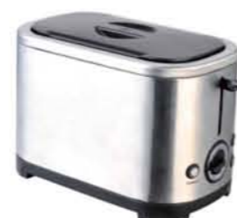
● TXT-829K Cover optional

100-120V/220-240V 50/60Hz 600-700W Gift Box: 27.2x15.4x17cm Carton: 48.2x28.7x36.5cm/6pcs G.W./N.W.: 8.72/6.93kgs 3408pcs/20' 7008pcs/40' 8160pcs/40'HQ